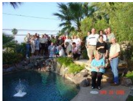
Kiowa Class of 1961 Alumni Palm Desert – April 20, 2008